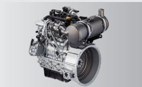
Euro V Doosan engine