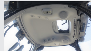
Full view cabin with A/C